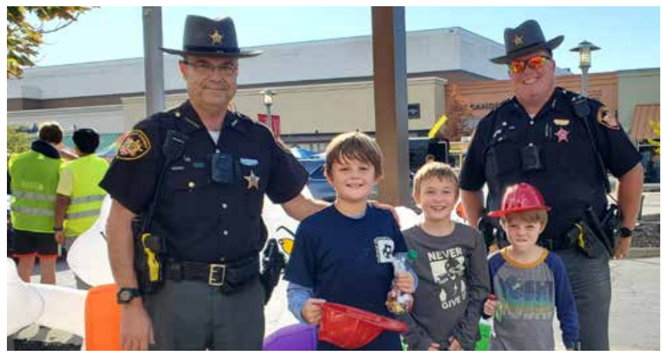
Anderson Township safety services are experiencing an increase in calls.

Current 2016 levy stretched three extra years to support township's emergency services as calls increase.